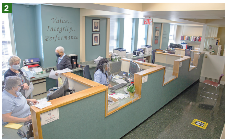
Clerks of the Motor Vehicle Record Department work in their old space in the Fiscal Court Building.