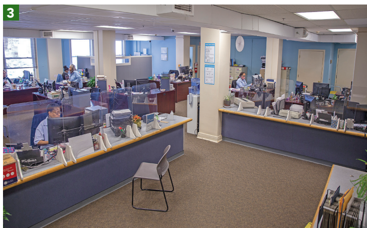
The previous Lien Department on the second floor in the Fiscal Court Building.