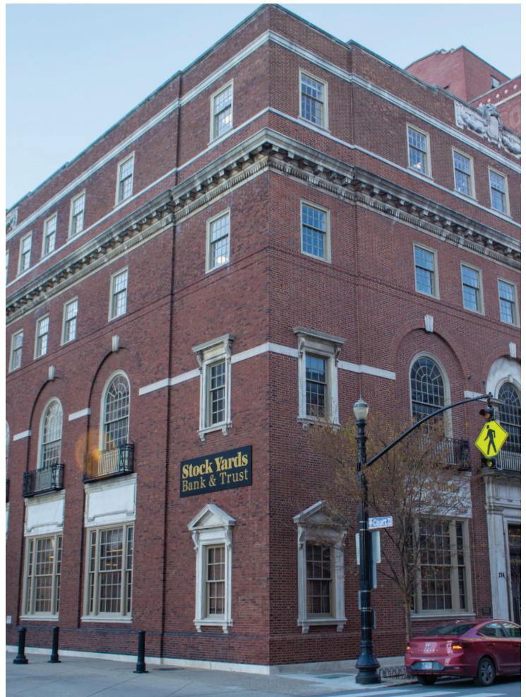
The First Trust Centre, colloquially known as the Stock Yards Bank Building, at the Corner of Fifth Street and Court Place.