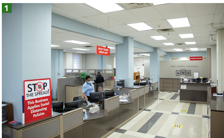
The original Dealer/Specials Department on the first floor of the Fiscal Court Building.