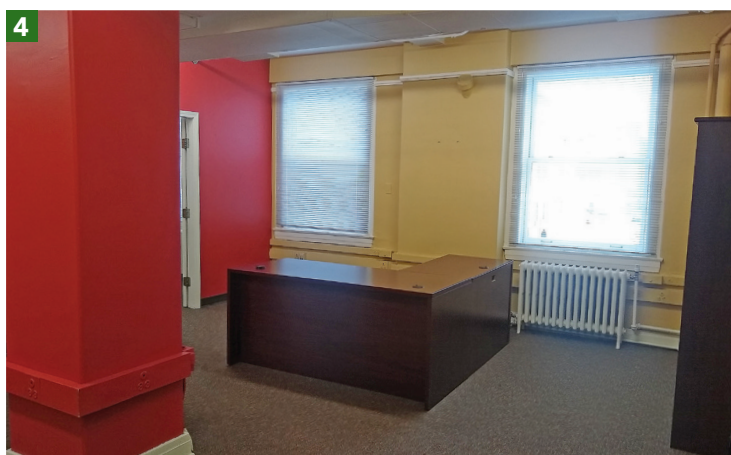
This space used to house Motor Vehicle Administration, the department that oversees all Motor Vehicle business in the County.